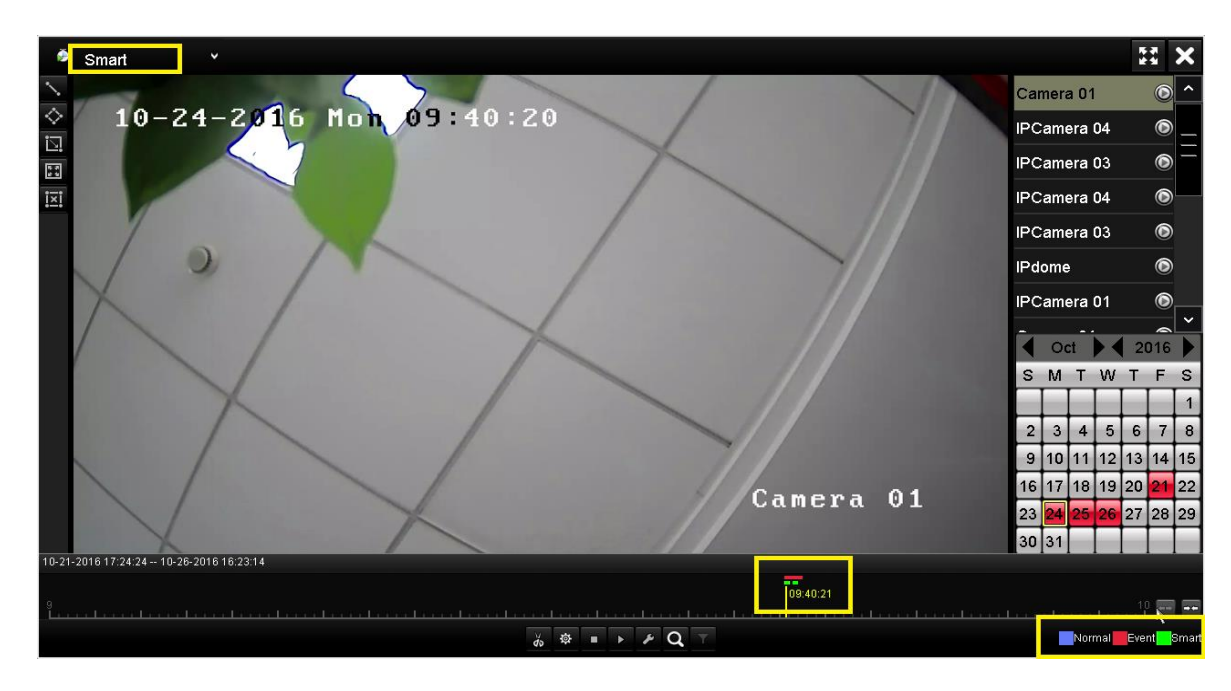
Detailed Explanation of Smart Playback Toolbar