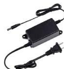
DC12V/2A Power Adapter